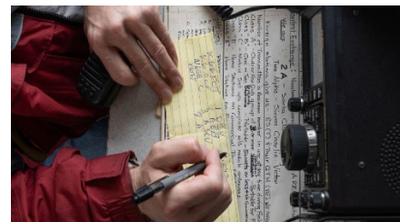
2024 ARRL Field Day

U R V E O J R O T C E N N O C F H U E D S W A P H O N E T I C A B L E L G N A O P R I R X M O S F E T G N I C I L O P E D I T L I Y R T S I M E H C G R S E R R C V Z T L A H A P O O L T V N K L D E E H X H C Y F B E H B M O L E I W I O O H A C T I V E U L E T M Y N X Z M M C A P N M I C R O R L E C A X O C I U I I E S G W C O A X I A L S O P I N N L T R H O E M E R G E N C Y V F T T A O T E A A T O M I X E R T U X Y E E A I I I R V M E V T H G I A R T S N R S N R N M N O M N E M S E D O M C G F G T I C O E O L E G R F U T O K Z A E N Z A M O N T I U T A R L R P N M M R I S F G A R K E S N E M F O O I D E D C U A E L E F R E T R R H S M P E N E O R O T A C I D N I E Q S A M A G C E D N W O D K A E R B P E R R O R V E F E S F Y C N E U Q E R F R Q C T S P E E C H Q G N I S S E C O R P Y