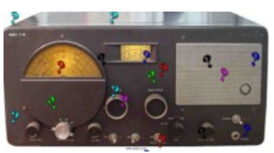
Each month I'll try to post a different radio for you to name. Best of Luck! Winners get "Bragging Rights"