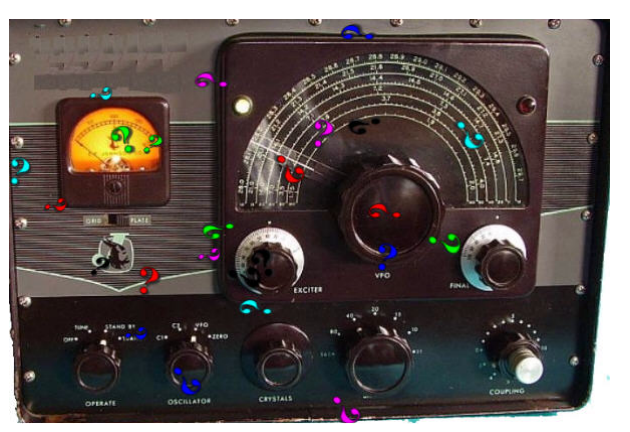
JOHNSON VIKING NAVIGATOR